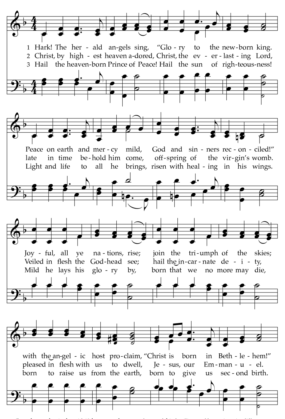
Brought together in the mid-19th century, the text and tune of this familiar carol began in quite different forms. The text had ten stanzas and began, "Hark, how all the welkin rings." The tune was created for a festival celebrating Gutenberg's introduction of moveable type.