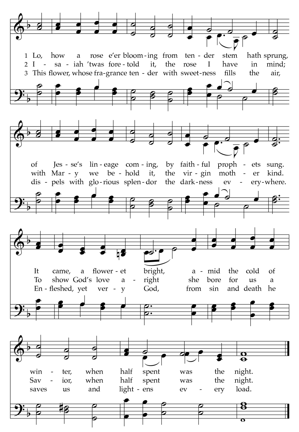
Although the early copies of this 15th-century German text include many more stanzas than are printed here, this simpler, shorter form has much to commend it. This early 17th-century harmonization of the traditional chorale melody invites and rewards singing in parts.