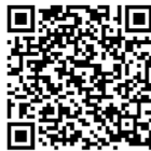
Electronic Pledge Card

Pledge Dedication Sunday—Today! On this Pledge Sunday, we are reminded of the generosity of this community. If you have brought your 2025 estimate of giving to the church, you can add it to the offering plate at the bottom of the chancel steps. Estimate-of-giving cards are available to fill out please see an usher for a pledge card, or you can scan the following QR code with your phone:.