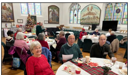
December's RPM Café