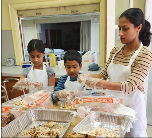
Cooking in Community in October